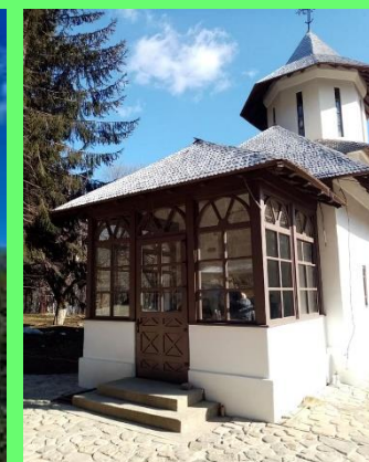
Lespezi Monastery (1601)