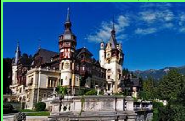
Peles Royal Castle, Sinaia